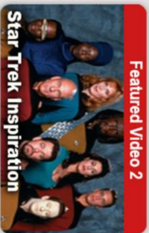
Featured Video 2